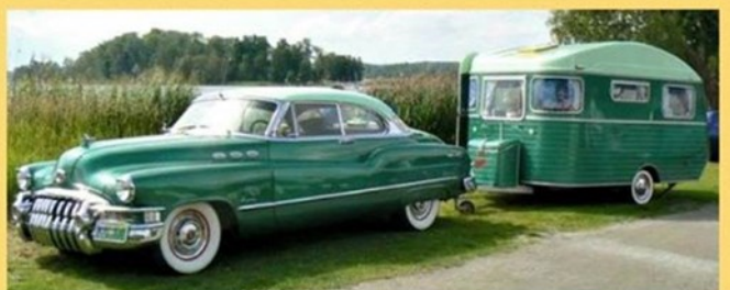
1952 Buick Riviera Hardtop with Matching Trailer