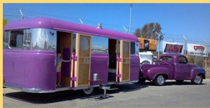
1949 Studebaker Pickup with Purple Trailer to Match