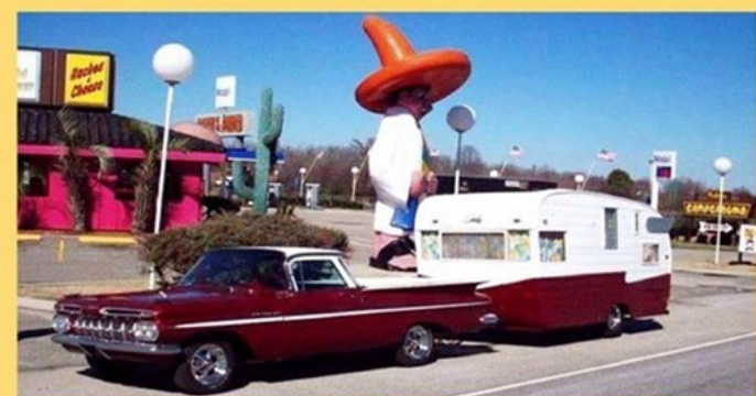
1959 Chevrolet El Camino with Shasta Travel Trailer