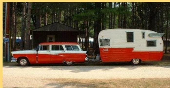
1955 Ford Customline Wagon with Shasta Trailer