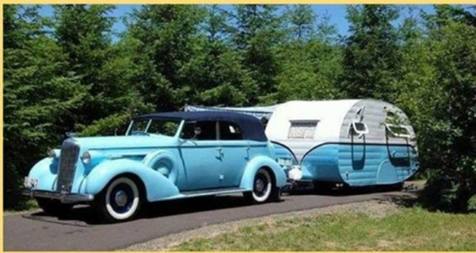
1935 Pontiac with Turquoise Canned Ham