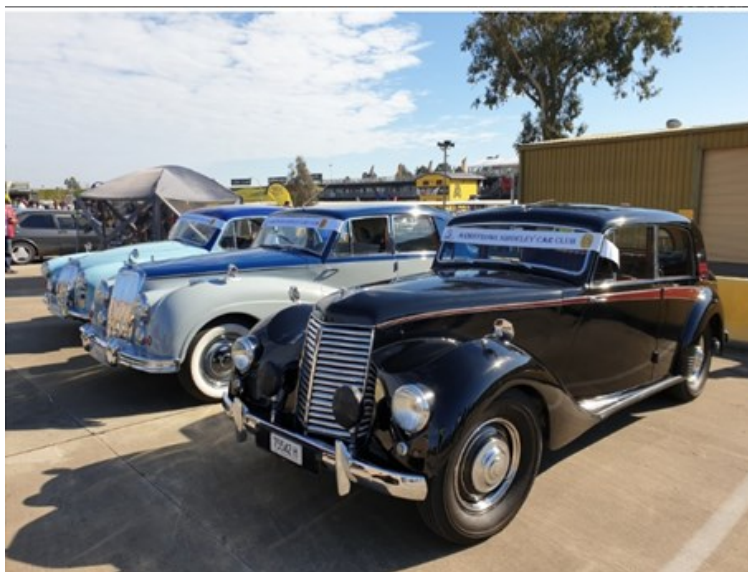
Just a few of the Armstrong Siddeley vehicles celebrating 100 Years Centenary in 2019.

Best Trade Display - Hare & Forbes (garage 16)