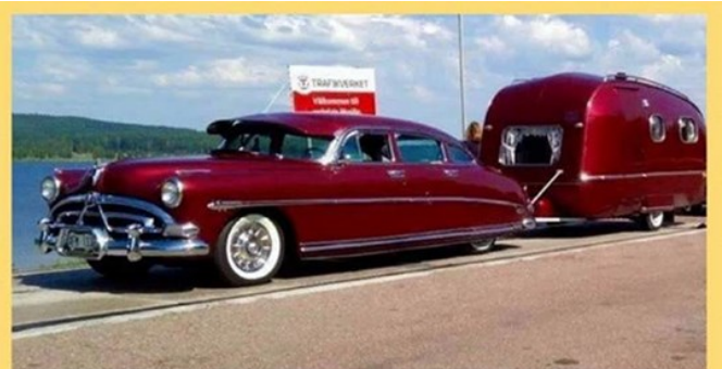
1951 Hudson Commodore with matching Trailer