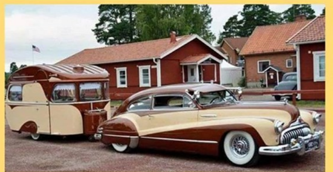
1947 Custom Buick Sedanet with Matching Trailer