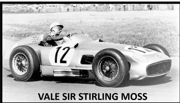
VALE SIR STIRLING MOSS

Sir Stirling Moss, one of the all-time greats of motorsport has passed away, aged 90.