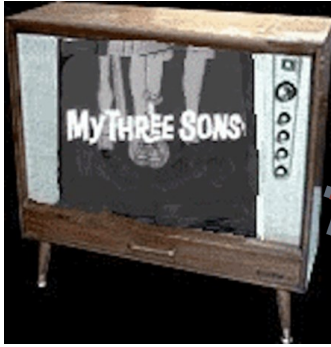
It took five minutes for the TV to warm up