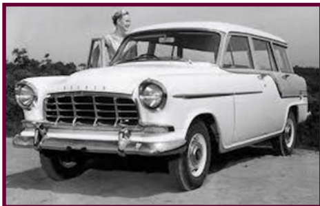
When an FC Holden was everyone's dream car.