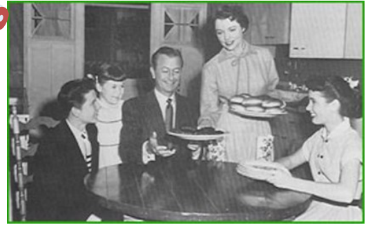
Nearly everyone's Mum was home when the kids got home from school