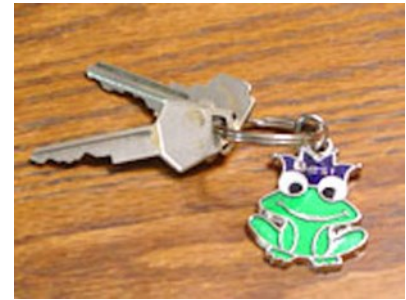
No one ever asked where the car keys were because they were always in the car, in the ignition and the doors were never locked