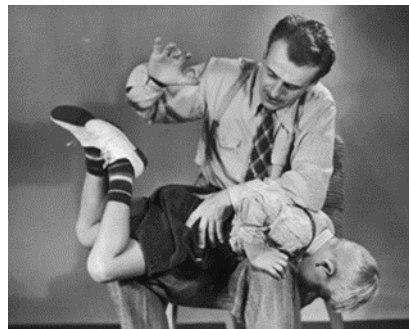
When being sent to the headmaster's office was nothing compared to the fate that awaited you at home.