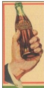
And then there were adding machines, Coke in bottles, 45 & 33 rpm records, Fags (lollies) - great memories.