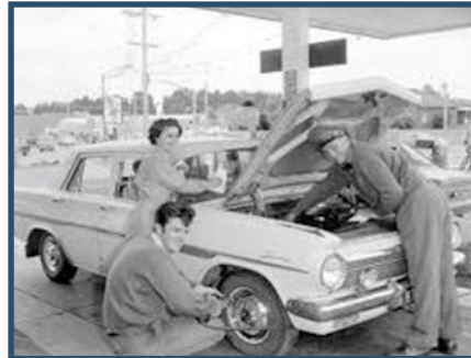
You got your windscreen cleaned, oil checked & petrol served, without asking, all for free, every time.